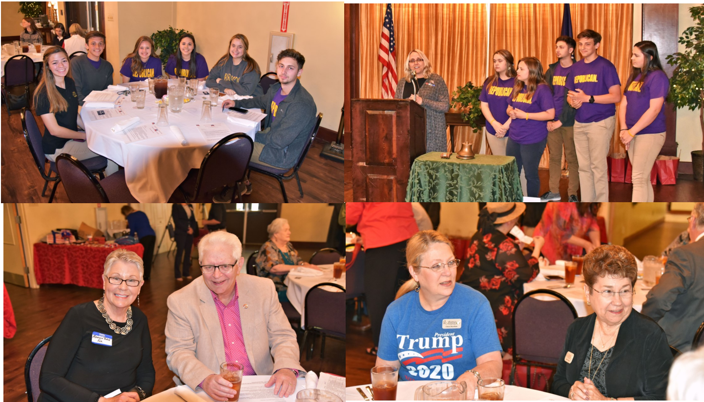
March 28, 2019 Luncheon Meeting