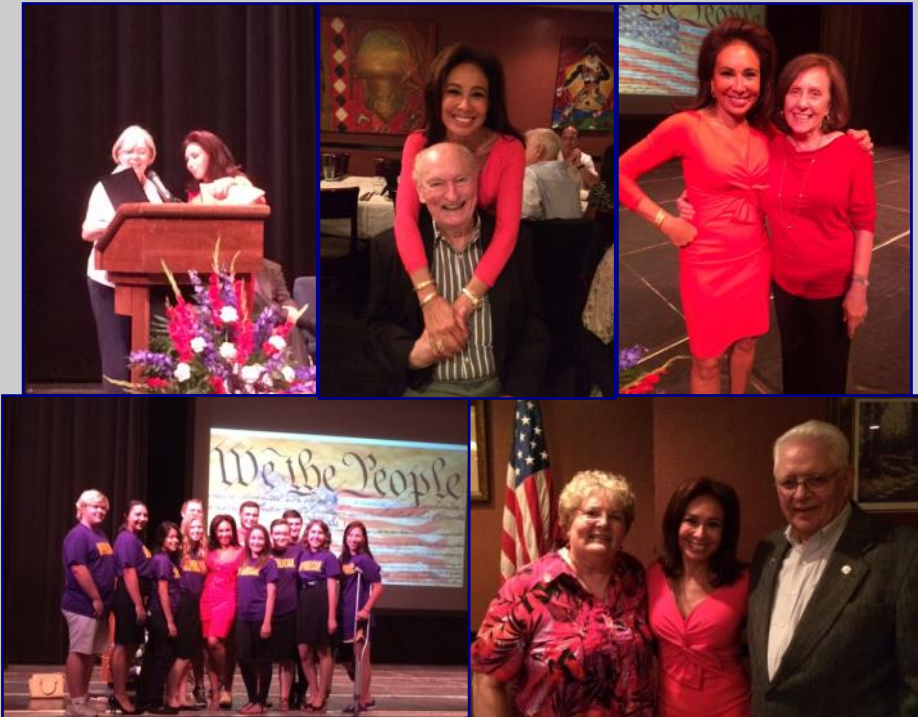
Constitution Day with Judge Jeanine Pirro