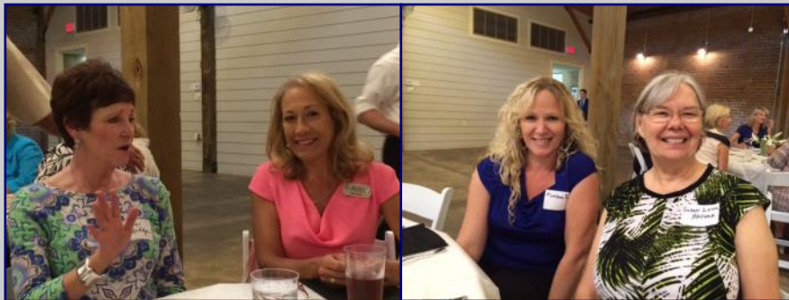
Candidate luncheon - Cash & Carry Building