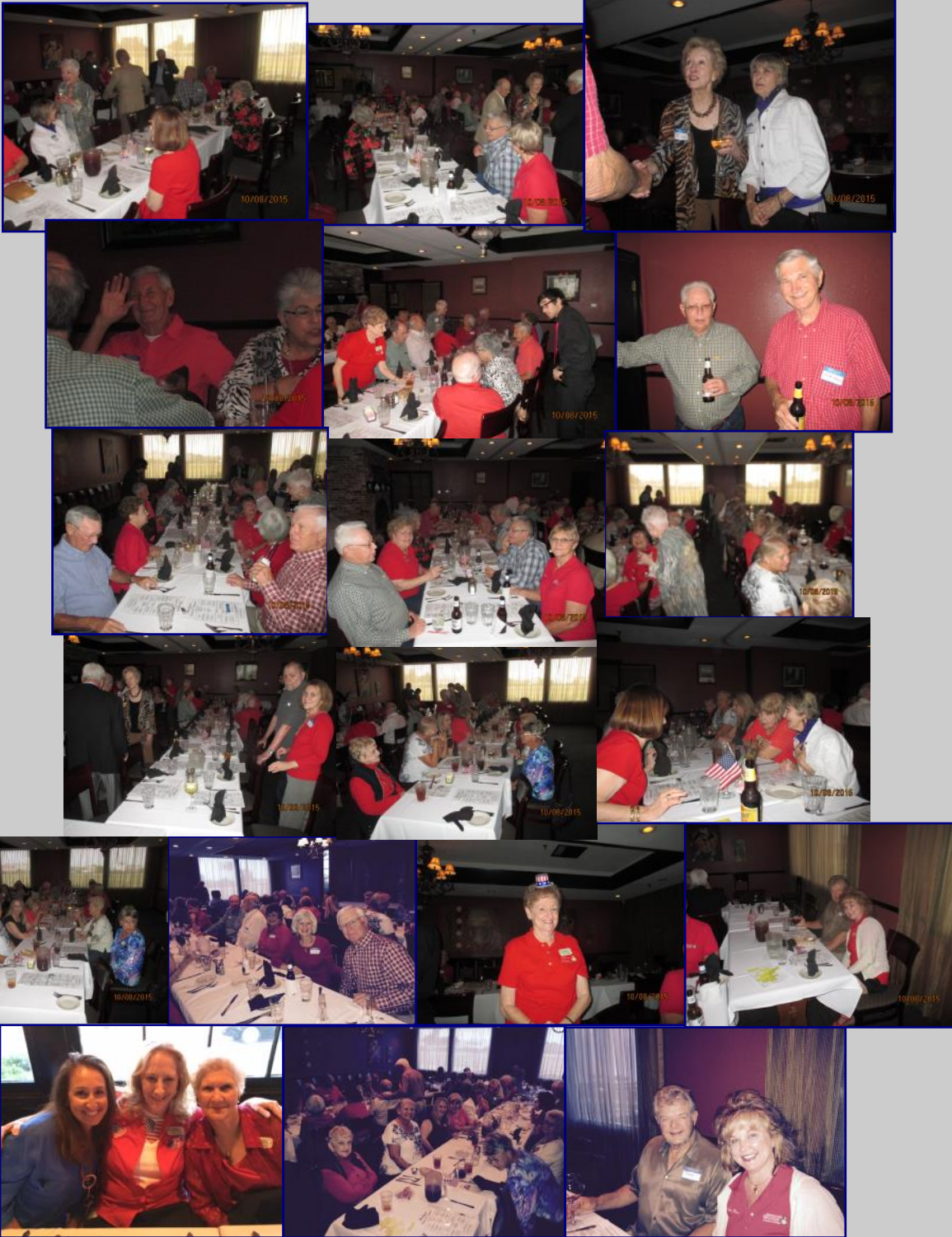
October 8 Club Social The Harlequin