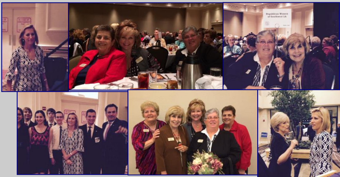
An Evening with Laura Ingraham LFRW Fall board meeting Baton Rouge