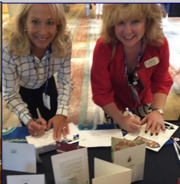
Armed Forces Card signing